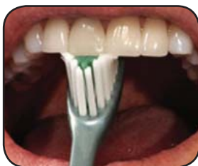
Brush inside of incisors