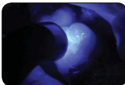
Curing light hardens sealant