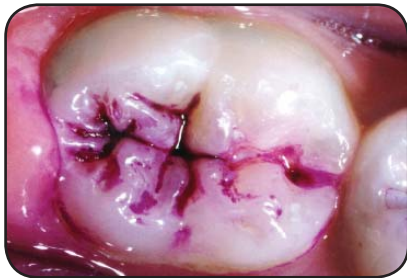
Red dye reveals plaque in pits and fissures