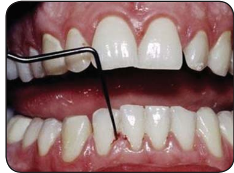
Gums bleed when probed

This treatment disrupts the growth of the bacteria, but some bacteria remain and may settle back into the pocket where they reproduce. In fact, the number of bacteria doubles every time they reproduce, reaching destructive levels in as few as 90 days.