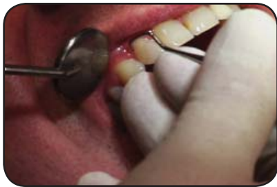
Removing plaque below the gumline