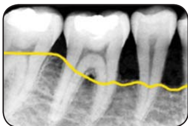
Bone loss caused by periodontal disease

Regular brushing and flossing are not enough to effectively remove plaque from your teeth. Instead, it takes special tools and techniques to keep your teeth clean. Here is why.