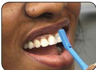
Periodontal homecare instruments