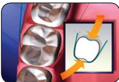
Floss stretches across indentations