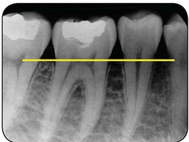
Healthy bone level