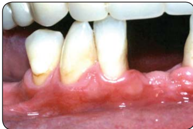
Periodontal disease causes tooth loss