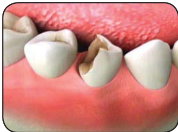
Severely broken tooth

A cast post and core is a one-piece unit. The post section is placed into the inner part of the tooth, and the core provides a foundation for a crown. It is precision-crafted in a dental laboratory, so the procedure may take two or more appointments.