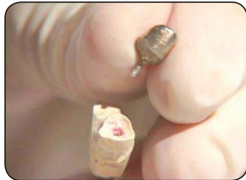
Cast post & core