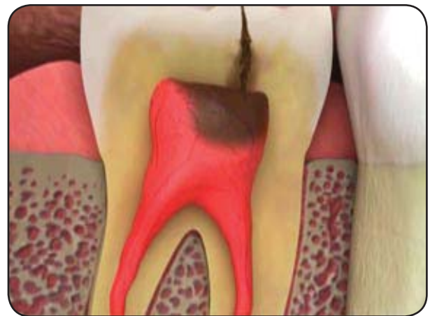
Infection spreading into the pulp