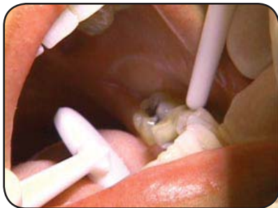
Tapping the tooth

You may also be unaware of the problem because there are no symptoms at all.