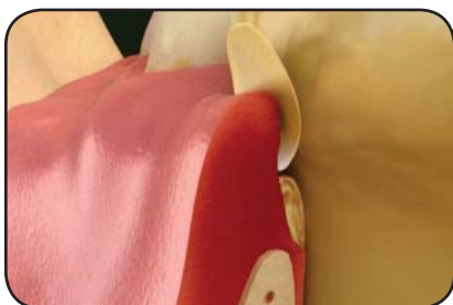
Popcorn hull trapped in sulcus

There are several conditions that can cause a periodontal abscess. Many are caused when periodontal infection flares up in a gum pocket and grows quickly, forming an abscess. Injured gums can sometimes form an abscess when they are infected by bacteria that live naturally in your mouth, especially if the gums are already affected by periodontal disease.