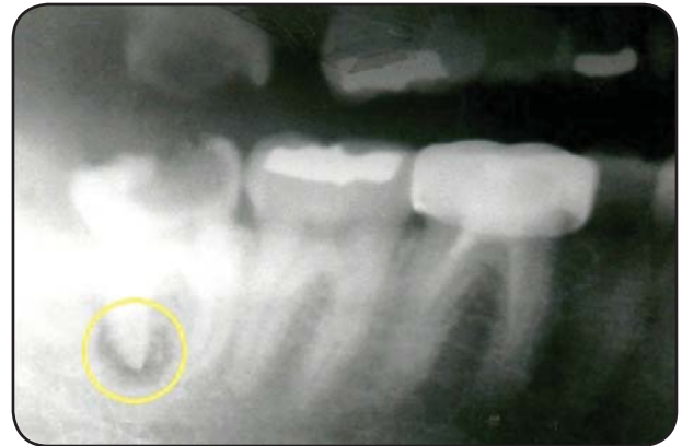
Endodontic abscess at root tip

The infection can then spread from the pulp chamber, down the root canals, through the tip of the root, and into the jawbone, where the pus builds up and creates a hole in the bone. This is the abscess.