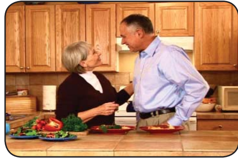
Bad breath can be embarrassing