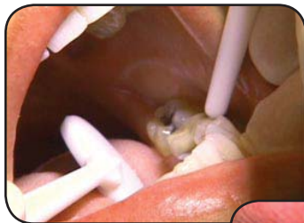
Tapping the tooth

You may also be unaware of the problem because there are no symptoms at all.