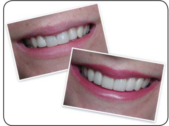
A dramatic improvement

A veneer is a thin shell of porcelain or plastic that is bonded to a tooth to improve its color and shape. A veneer generally covers only the front and top of a tooth. Veneers can be used to close spaces between teeth, lengthen small or misshapen teeth, or whiten stained or dark teeth. When teeth are chipped or beginning to wear, veneers can protect them from damage and restore their original appearance.