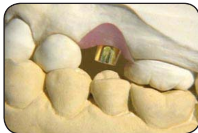
Implant post on model

With proper homecare and regular checkups, your implant can be a long-term solution for a natural-looking smile.