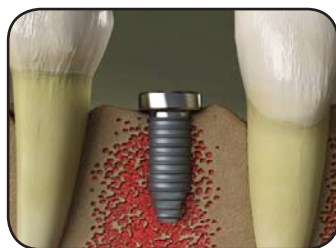
Implant in healthy jawbone