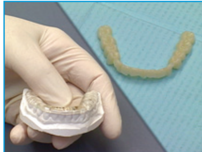
Orthotics stabilize the bite

Once we have determined that a bad bite is causing your TMD or other problems with your teeth or jaw joint, we can use a number of procedures to stabilize your bite and allow your chewing muscles to stay in their most comfortable, relaxed position. Treatment often follows two phases.