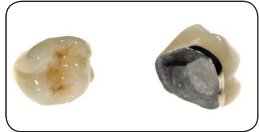
Crown showing fused metal inside the crown shell