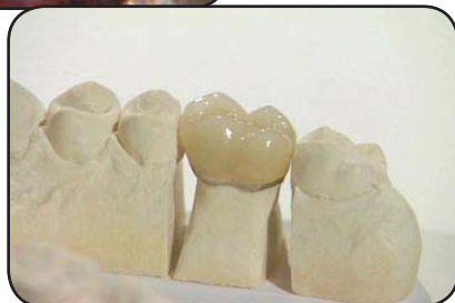
Trying crown on model