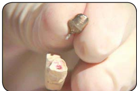
Post & core (buildup)