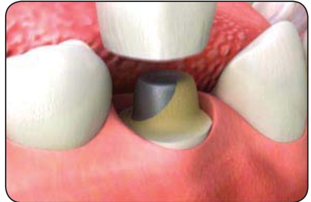
Crown is placed over post & core