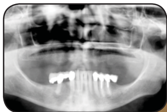
X-rays showing health of jawbone

Dentures can be a good way to help you eat more easily, speak clearly, and have a natural-looking smile.