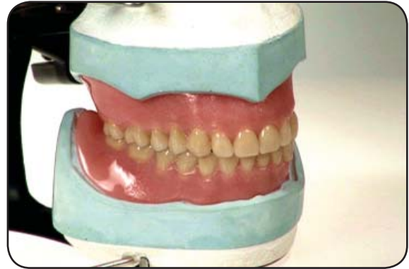
A conventional full denture

If you are thinking of delaying treatment, you should know that the jawbone will continue to shrink, making future treatment more complex. And without treatment, speaking and eating properly will become increasingly difficult. Your lips and cheeks will lack the support they need for a more youthful appearance. For these reasons, we recommend treatment now to help you stay healthy and keep a beautiful smile.