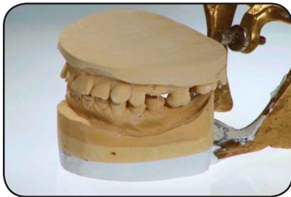
Model made from an impression

Immediate dentures have several advantages. They protect your gums and help control bleeding after the teeth have been removed. You are never without teeth, so you'll have a natural-looking appearance, and you won't need to learn how to eat and speak without teeth. Dentures also support your cheeks and lips for a more attractive smile.