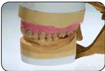
Immediate denture on model